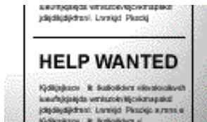
Join our Chapter as an active member. Volunteers wanted and appreciated.