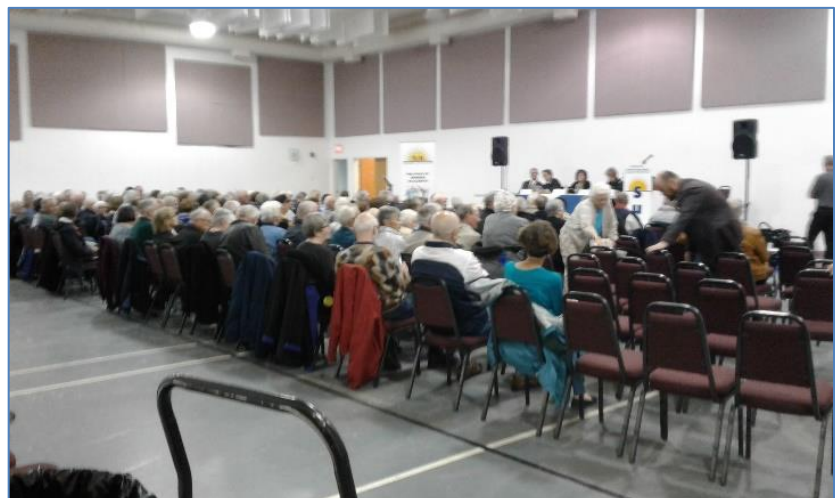
September 19, 2017 Bethel Lutheran Church - Mayoral Candidate Forum